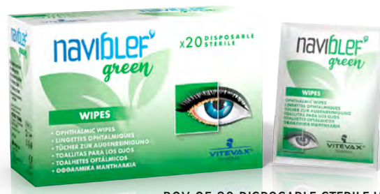
BOX OF 20 DISPOSABLE STERILE WIPES